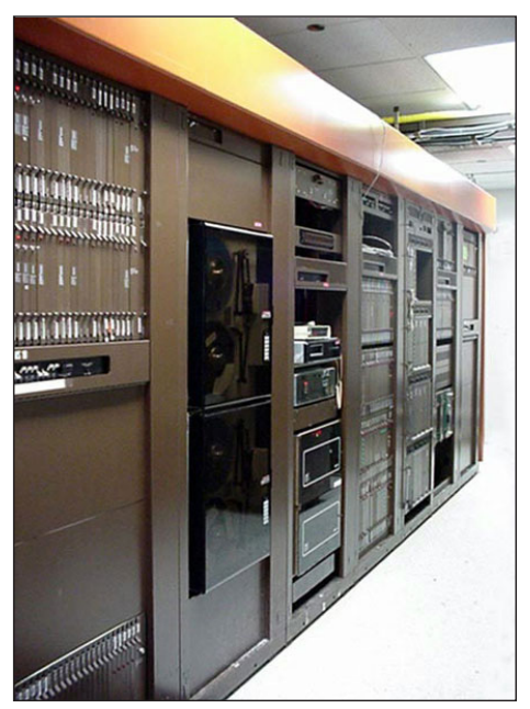
"State of the Art" Nortel DMS100 Switch circa 1979 U.S.

Even though broadcasters have embraced ISDN, the market is niche and relatively small in comparison to other markets serviced by the major telcos. Much of the Central Office hardware for ISDN and POTS circuits, such as the 5ESS and DMS100 Central Office switch, is antiquated and parts are no