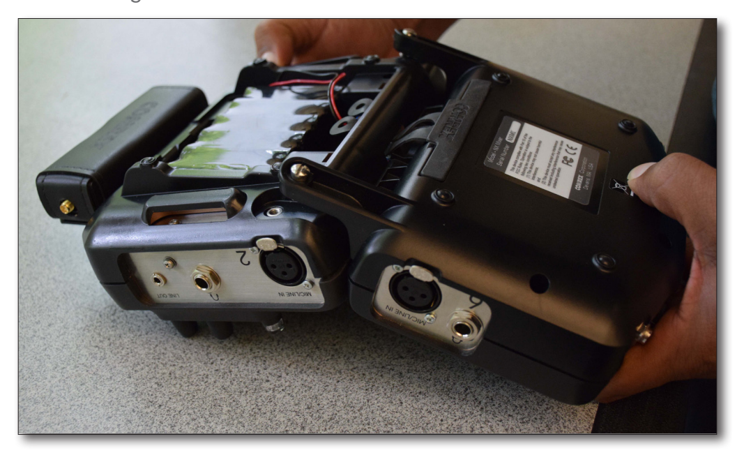
STEP 4: Tighten the screws, place the battery pack back into the NX

Hold the mixer at a slight angle and insert into the bottom slot. Check the wires are safely inside and tilt the mixer so that it is in alignment with the NX.